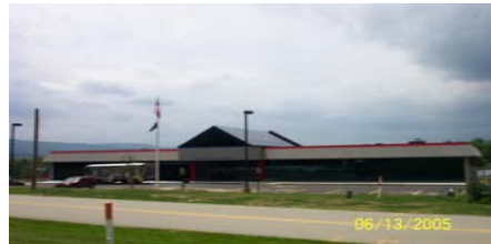
The FACT Transit Center

Trips across county lines within the Commonwealth will be approved only if the trips to out-of-county facilities are a part of an approved and clearly identified/specified operating plan.